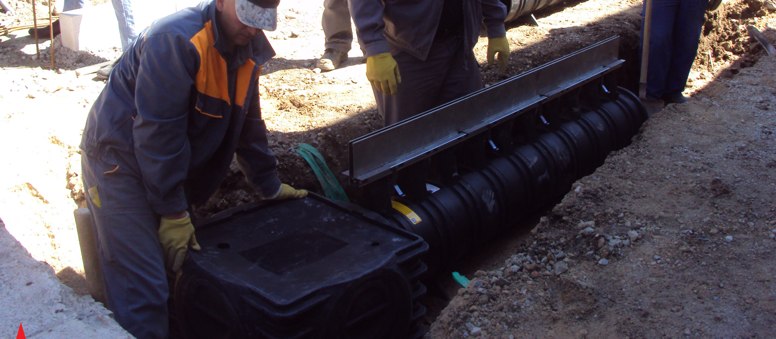
The ACO Qmax 350 drainage channels are reliable solution for high hydraulic requirements