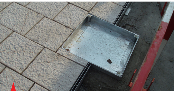
ACO TopTek cover