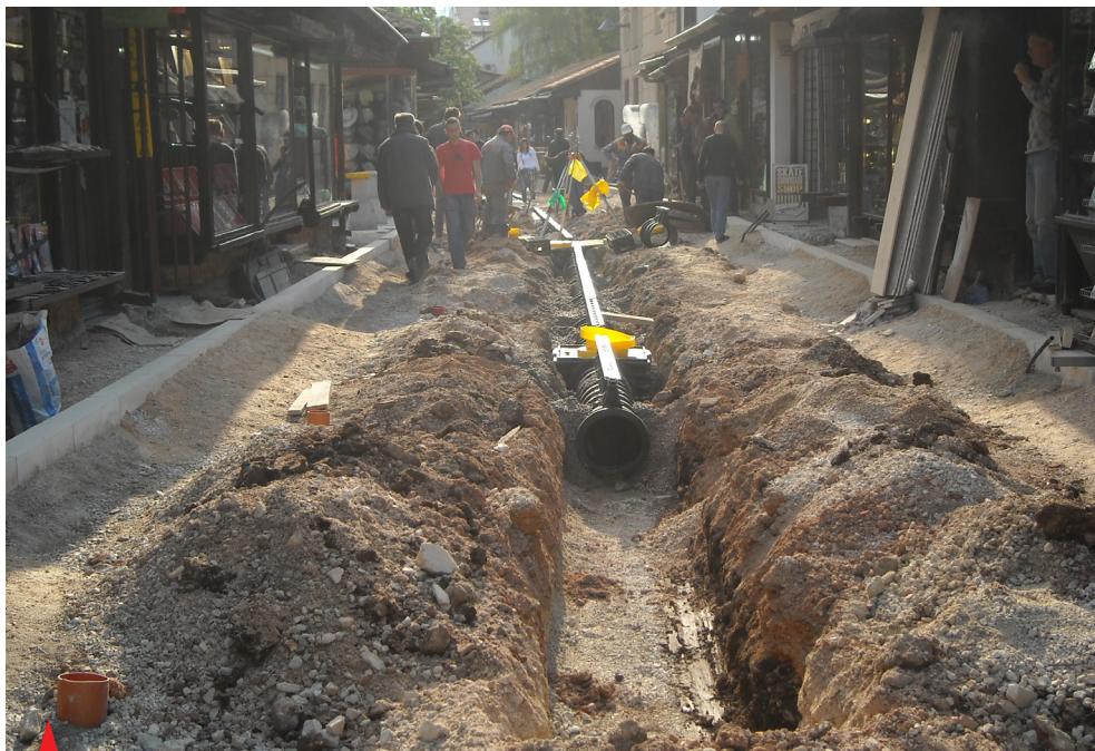
ACO Qmax 350 drainage channels for high hydraulic requirements