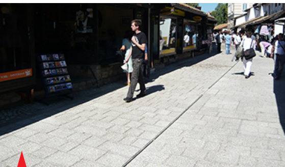
Sarači after the reconstruction