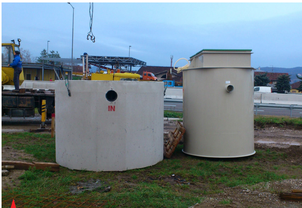
ACO Oleopator petrol and light mineral oil separator (on the left) and ACO Clara Wastewater Treatment Plant