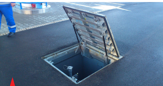
ACO Servocat access cover