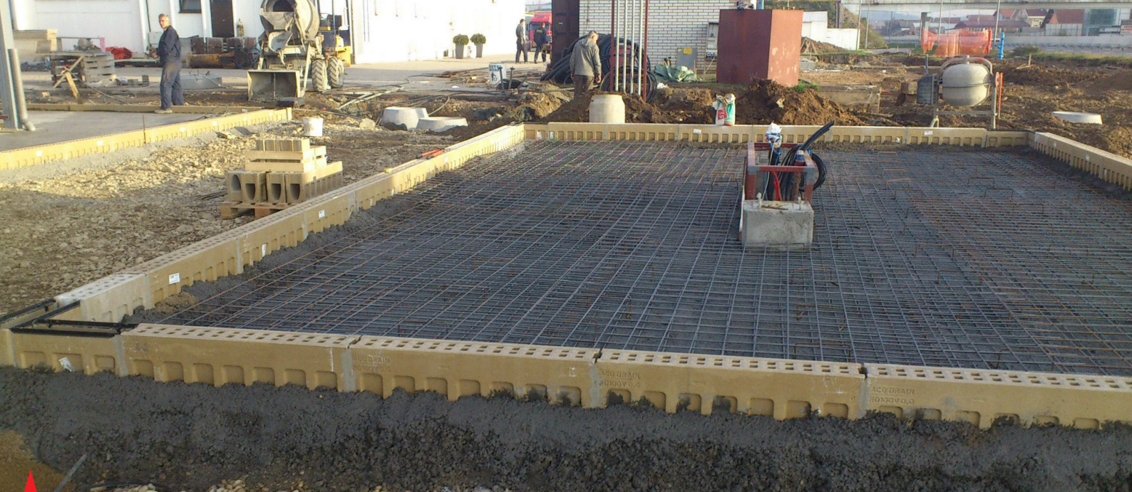
The ACO Monoblock drainage channels are reliable solution for the heavy traffic